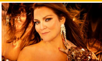
Iceland Hera Björk - Scared of Heights